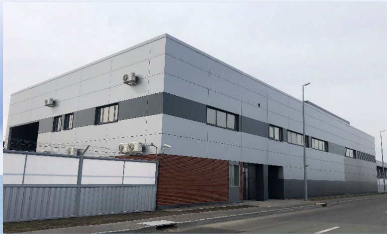
Building for inspection and clearance of goods