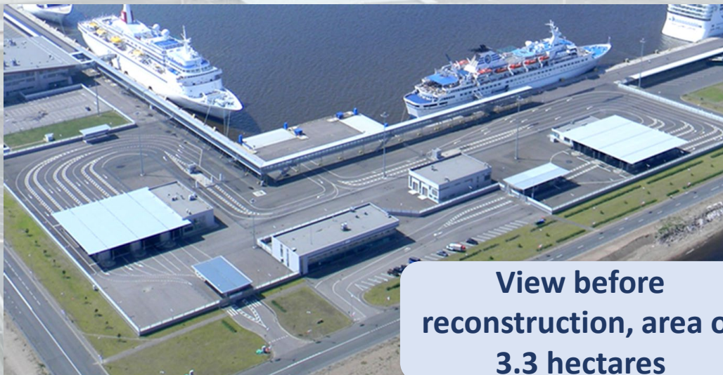
View before reconstruction, area of 3.3 hectares