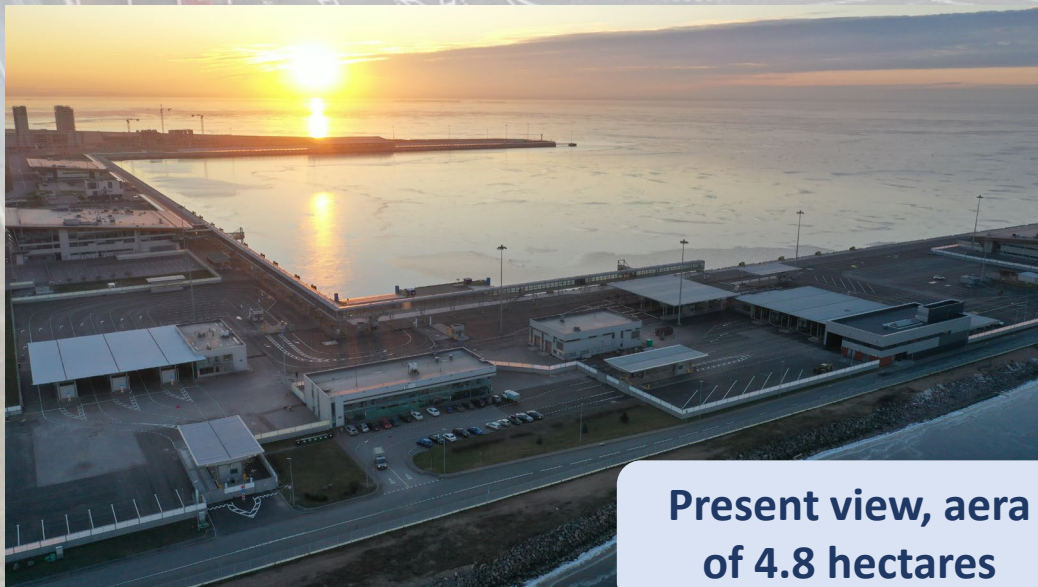
Present view, area of 4.8 hectares