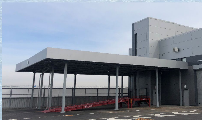
Cargo unstuffing and inspection area